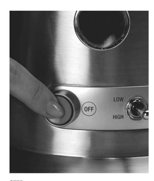
STEP 1. Push the "OFF" button on the 800 Class Juicer and then unplug from the power outlet.