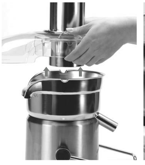
STEP 5. Lift the Juicer Cover off the 800 Class Juicer.