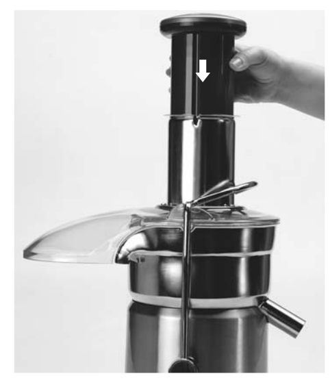
STEP 5.1. Continue to slide the Food Pusher down the Feed Chute.

ASSEMBLING YOUR BREVILLE BOO CLASS JUICER 11