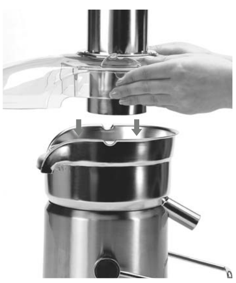
STEP 3. Place the Juicer Cover over the Filter Bowl Surround, positioning the Juicer Cover over the Stainless Steel Filter Basket and lower into position.

the Filter Bowl Surround and onto the Motor Base.