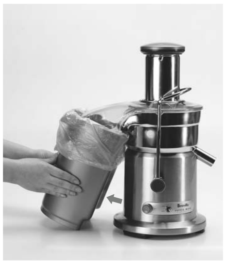
STEP 2. Remove the pulp container by holding the handle and pivoting the bottom of the Pulp Container away from the juicer.