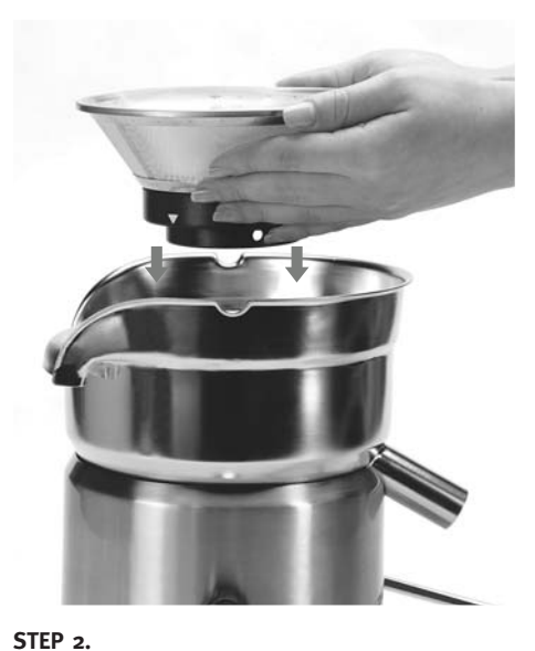
Align the arrows on the Stainless Steel Filter Basket with the arrows on the Motor Drive coupling and push down until it clicks into place. Ensure the Stainless Steel Filter Basket is fitted securely inside

the Filter Bowl Surround and onto the Motor Base.