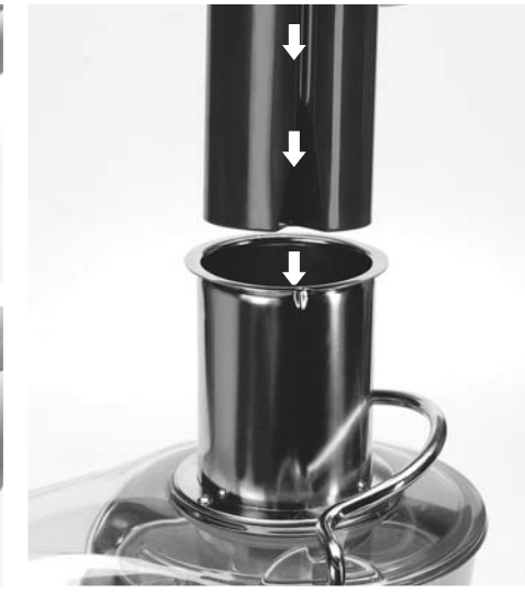
STEP 5. Slide the Food Pusher down the Feed Chute by aligning the groove in the Food Pusher with the small protrusion on the inside of the top of the Feed Chute.