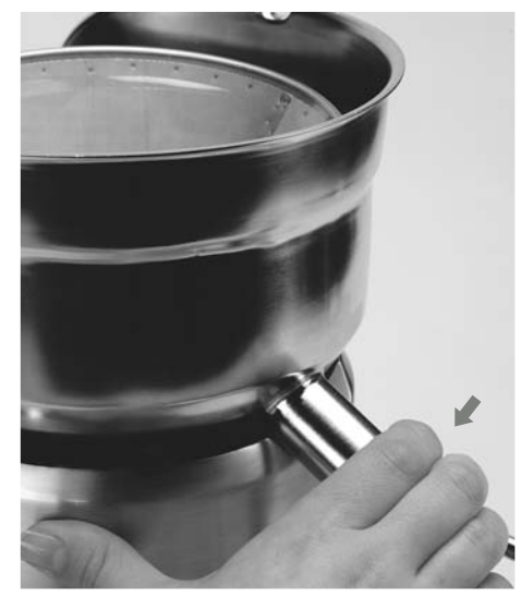
STEP 6. To remove Stainless Steel Filter Basket, hold base of juicer and turn Filter Bowl Surround by the Juice Spout.

DISASSEMBLING YOUR BREVILLE 800 CLASS JUICER 17