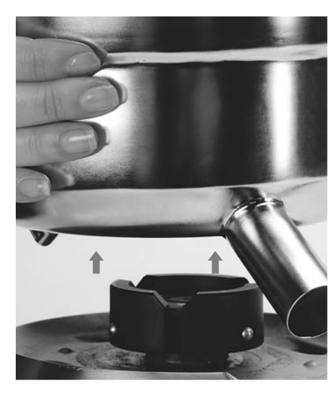
STEP 7. Lift off the Filter Bowl Surround with the Stainless Steel Filter Basket still in place.