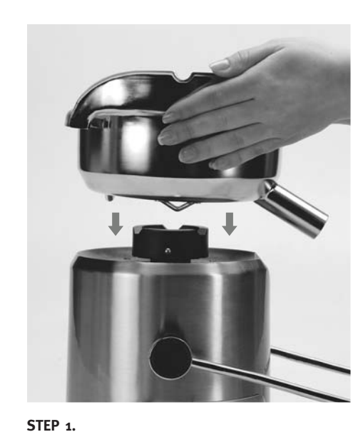
Place Filter Bowl Surround on top of the Motor Base.