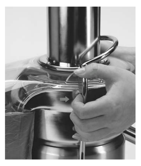
STEP 3. Place both hands on either side of the Locking Arm and pull back and lift over the grooves on either side of the Juicer Cover.