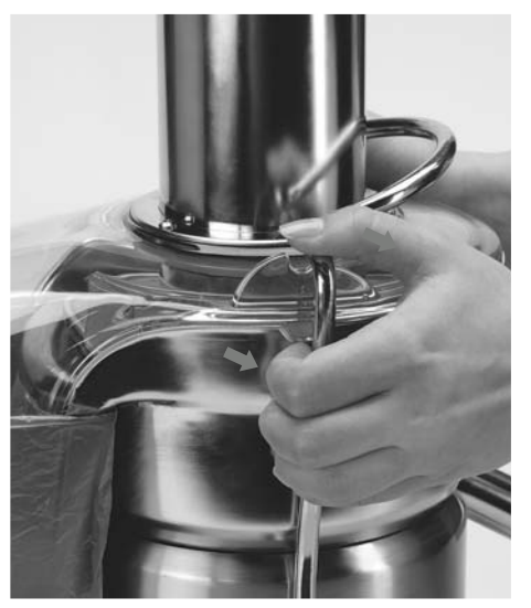
STEP 4. Move the Locking Arm down.