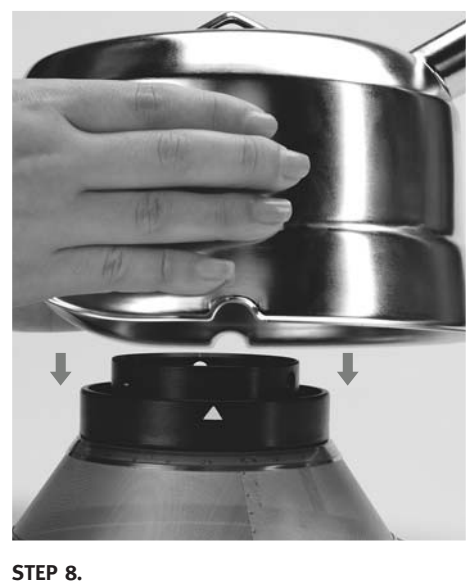
To remove the Stainless Steel Filter Basket, turn the Filter Bowl Surround upside down and carefully remove the Filter Basket. (It is recommended to remove the Filter Basket over