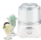
Ice Cream Makers

Discover the complete line of Cuisinart® brand premier kitchen appliances including food processors, mini food processors, hand mixers, blenders, toasters, coffeemakers, cookware, ice cream makers and toaster ovens at